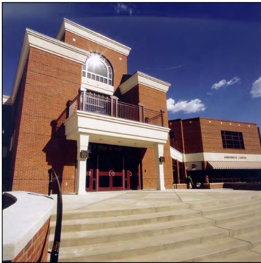
The Brossman Commons, dedicated in December 2002, has quickly become the campus “living room” for students, faculty, and staff.